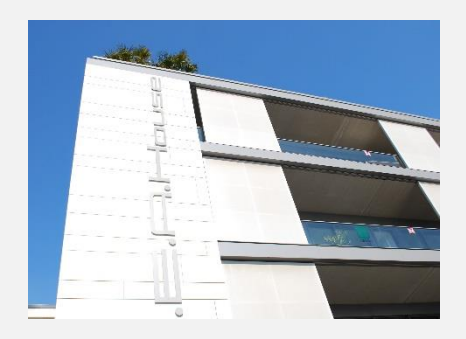
catkin® GmbH Hörder Hafenstraße 11 44263 Dortmund www.catkin.eu

We have been developing and implementing customized communication solutions in the B2B logistic sector since 2013. With our catkin communication platform, we support industrial and transport companies. With the help of our modern software technologies, our customers redesign their logistic processes in a digital, more transparent, and secure way.